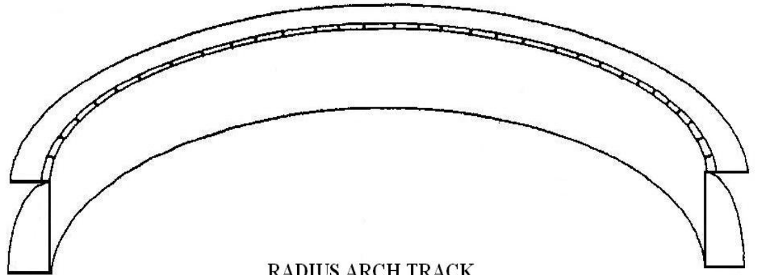
RADIUS ARCH TRACK